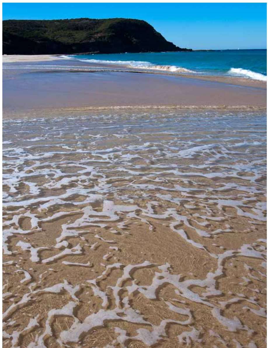
IMAGES: MIAN: View over Birdie Beach to Bird Island Nature Reserve. BOTTOM: Munmorah State Conservation Area.

Bookings for camp sites are essential – phone (02) 4320 4203, Monday to Friday between 9.00 am and 3.00 pm.