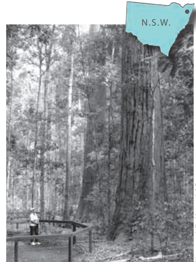
Norman Jolly Memorial Grove

Department of Environment & Climate Change NSW